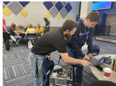
Figures 1 and 2: Teachers work with pedagogical tools