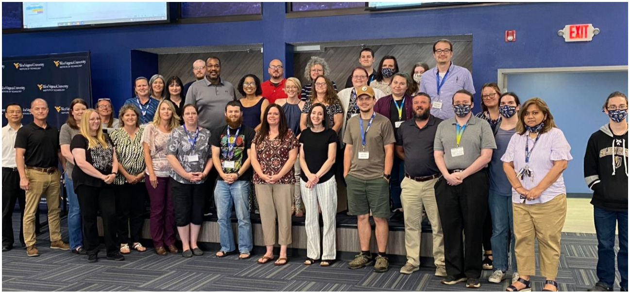
Figure 7: Success RPP Group