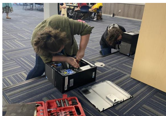
Figures 3 and 4: WVU TECH students working with the teachers